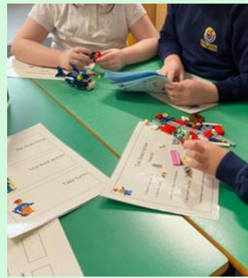
Year 5 children are working well in a group to develop their social and communication skills in a Lego Therapy session.