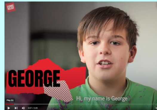
A screenshot of George's Autism film